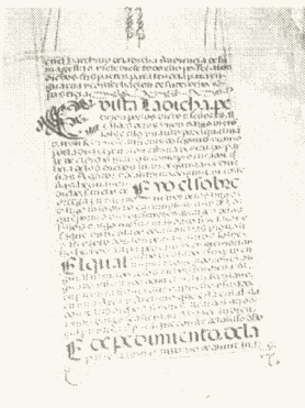
The Burgos Manuscript